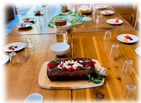
Birthday celebration table in Prep

In Steiner Education we get to experience the Circle of Time: In the morning, to greet the day; at mealtimes, to express gratitude for nourishment and abundance; in the evening to pause in contemplation of the day.