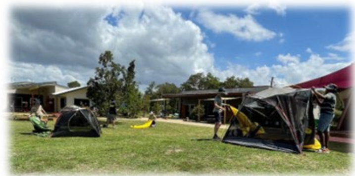
Class 7/8 Setting Up Tents in Preparation for Camp

This week, Class 7/8 are away on a hiking camp at Lamington National Park. They have been busy preparing for this camp with weekly cooking lessons on their camp stoves, working in duty groups to organise the menu and practising setting up their tents. We wish them well in this wonderful experience! We also have Class 3/4 going to Hosanna Farm stay for their first-ever class camp next week.