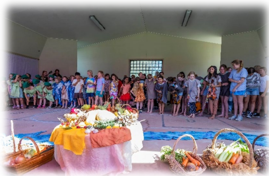
Autumn harvest celebration

And then there are the bigger cycles; birthdays that come around once a year, the seasons that we celebrate so beautifully here at Birali; the different planetary cycles in our solar system, the rhythms of the sun and the great Precession of the Equinoxes of 26,000 years.