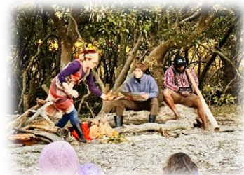
A puppet show we will never forget.

This term our group is growing with sibling enrolments after 2024 interviews, and we welcomed 3 new families last week - some of whom have relocated especially to attend our school.