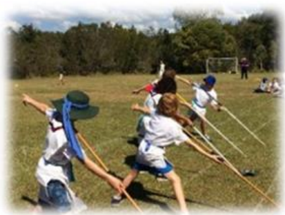
Greek Olympics at Nossa in 2018

This term, Biral will be the proud host for the Greek Olympics (10 th -11 th August) !