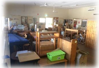
Moving from Beachmere Community Hall

This Friday we celebrate a very special occasion – Birali is turning 10!