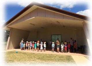
First Day on our Current School site

As we prepare for the 10 th birthday celebration, it has been wonderful to look back on how far our beautiful school has come in such a short time. Birali Steiner School opened its doors at the Beachmere Community Hall on 15 th April 2013 with 8 students. Our beautiful 26-acre block of land was purchased in 2016 and in November 2018, we had our biggest “Working Bee” to move onto our current school site.