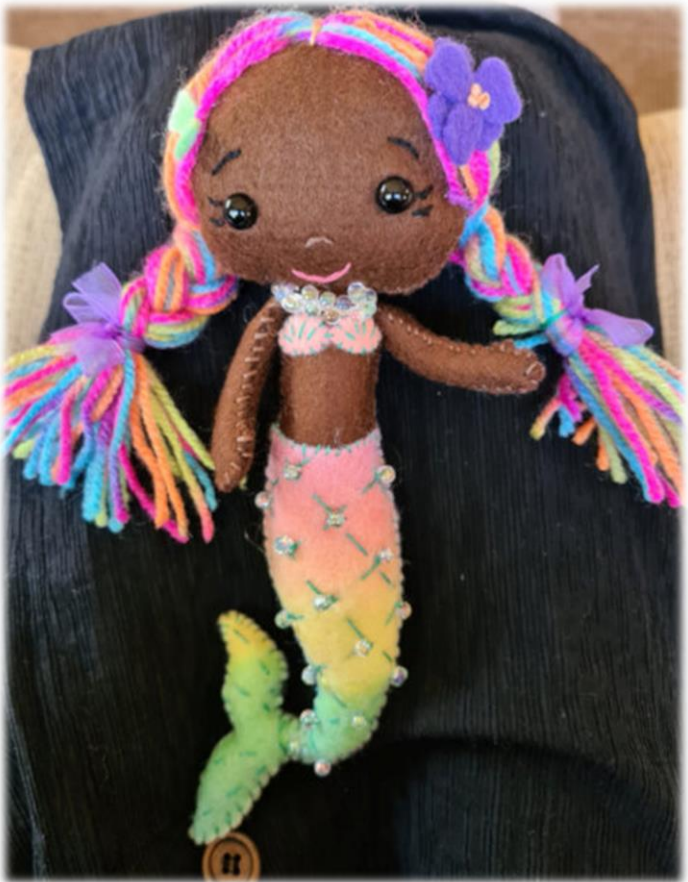
From the Birali Collective

Open during term Tues & Fri 2.00 PM – 3.00 PM Weds 8.45 AM to 12.00 PM