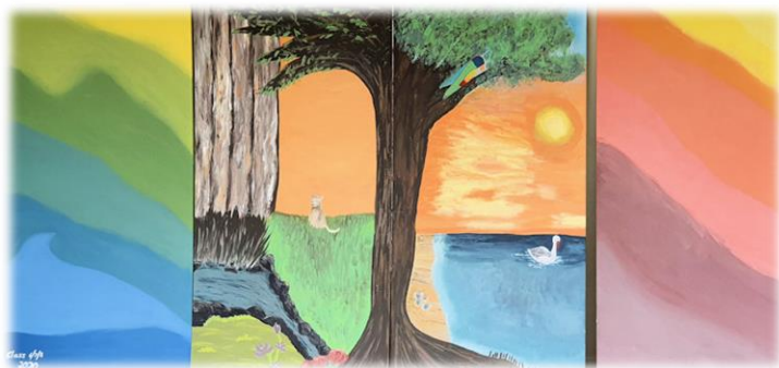
Mural painted by Class 6/7/8 in 2020 ready to install.